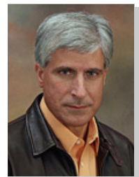
Steve Berry The Charlemagne Pursuit