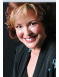
Jacquelyn Mitchard Deep End of the Ocean